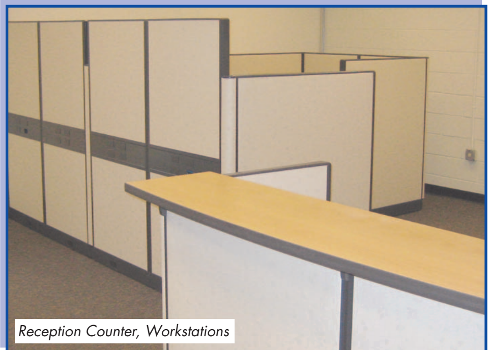
Reception Counter, Workstations