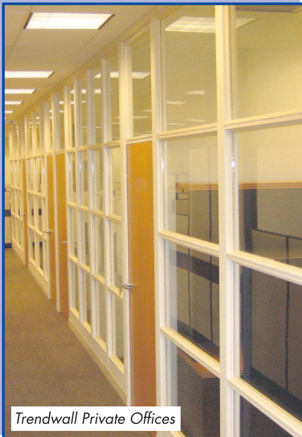
Trendwall Private Offices

Office environments & cultures are changing with the times and reconfigurable equipment is the main answer to a customer's needs now and into the future.