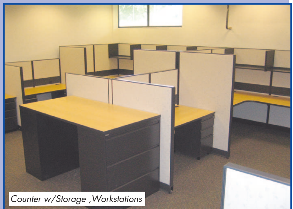
Counter w/Storage ,Workstations