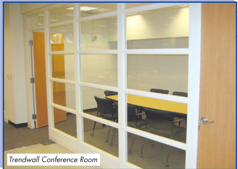
Trendwall Conference Room