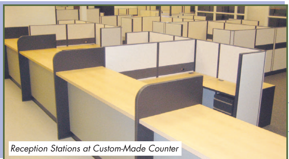
Reception Stations at Custom-Made Counter

were easily configured to fit into the building and the furniture laminate colors were matched to the custom-made construction.