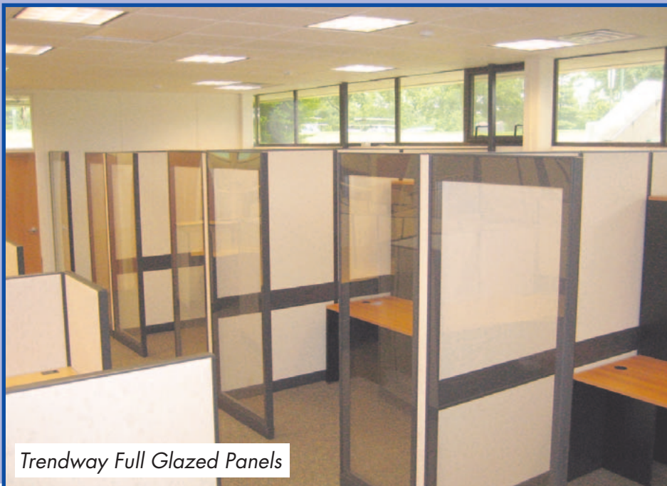
Trendway Full Glazed Panels

Using mixed-height panel systems, freestanding furniture, steel storage and ergonomic seating, Butler Office Interiors was able to adequately fulfill their needs now and into the future.